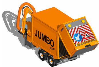
JUMBO MASTER 35 M 3