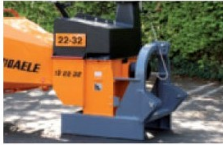
Standard 3-Point hitch