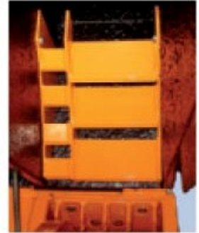
TV22-32 P; chip calibration system (optional).

B : 1960mm 1350kg H1: 3070mm H2: 1770mm L : 3620mm