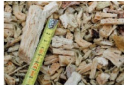
TV22-32 P; chips are applicable in heating applications and for energy production purposes (optional).