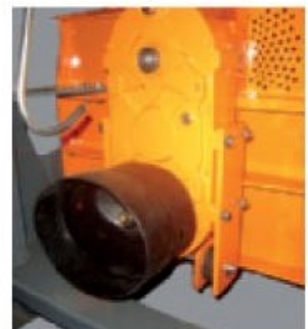
TV22-32 P; 540 RPM reduction gearbox (optional)