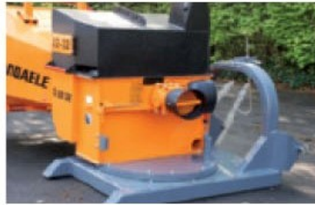
TV22-32 P; tractor driven on a 2x90° turn table (optional).