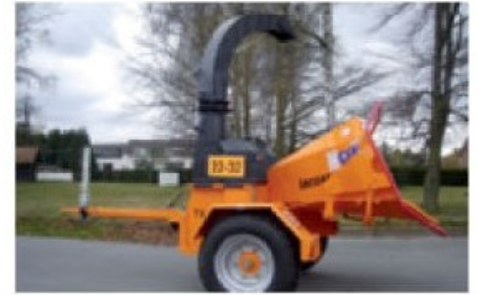
Slow speed trailer 40 km/h

The master of the road verge. Very robust and insatiable work horse. For chipping of twigs, branches & stems of any type of wood with maximum diameter of 220mm / 9". Available as a tractor driven unit.