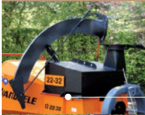
Foldable ejector chute (optional).