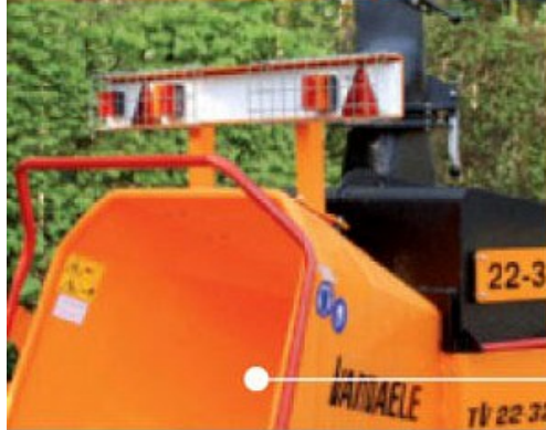
Road light mounted on funnel (optional)