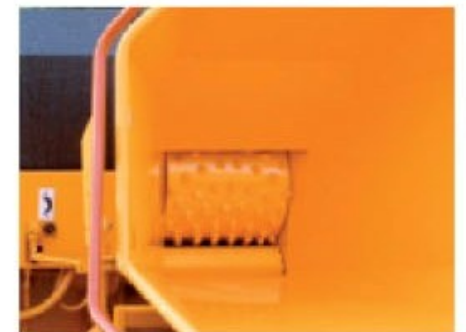
TV22-32 P; SUPER-GRIP thanks to the top infeed roll with studs (standard).