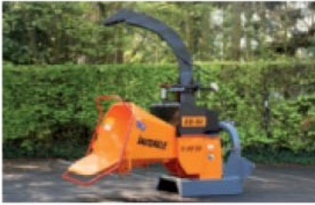
TV22-32 P; tractor driven.