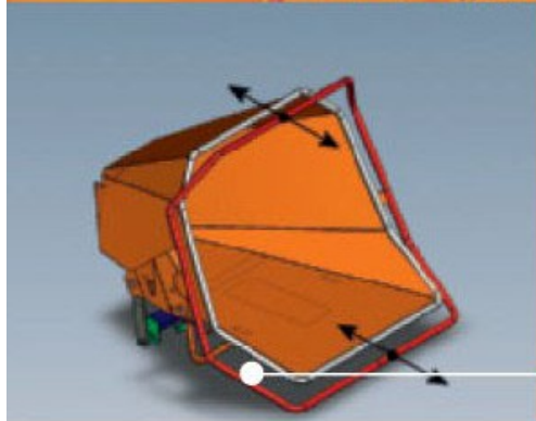
Optimum operator safety system: safety bar wrapped around the entire infeed funnel (VANDAELE® patent)